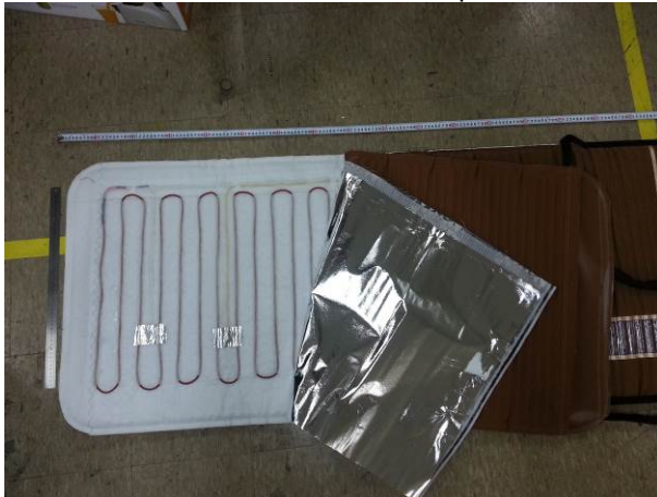
internal view of flexible part