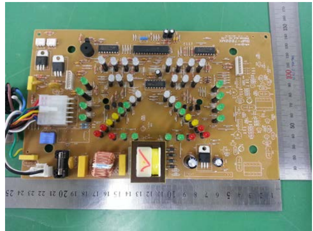
Internal view of control unit