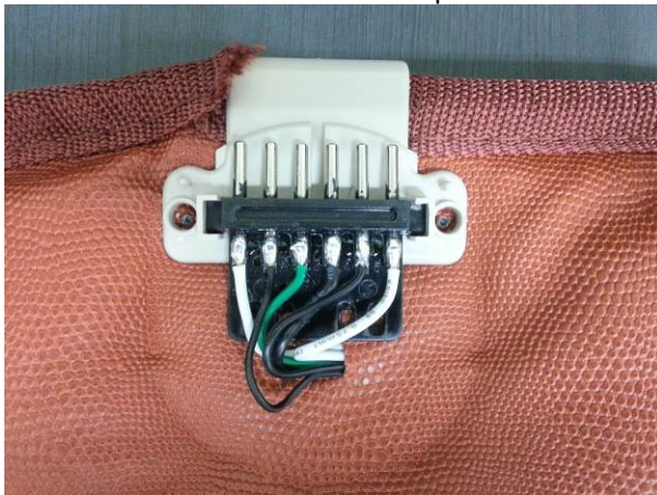
connector of flexible part