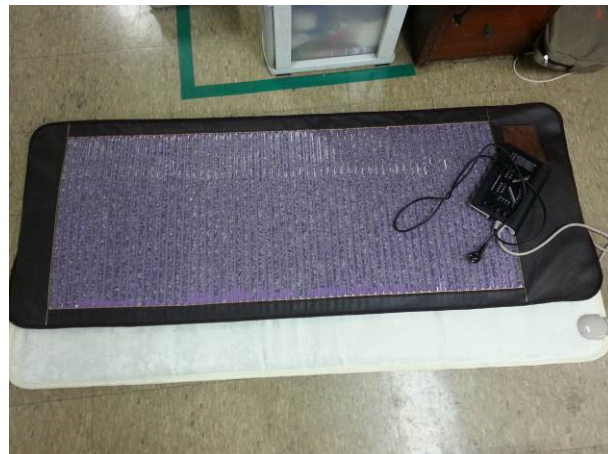
BIO MAT PROFESSIONAL S